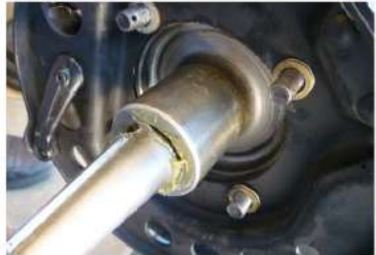
Fig.3 Special shims have been added on each of the four mounting bolts before the baffle is installed. The total thickness of the shim stack is a nominal .020" in thickness. This will space the castle nuts out further on the bolts and better align them with the cotter pin holes. It will also ensure that the nuts have not bottomed on the threads of the bolts.