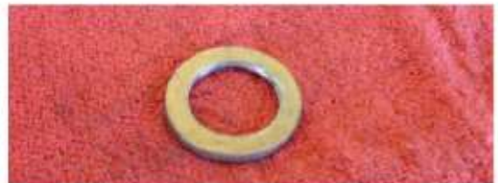
Fig.4 The shims that were used have an inside diameter of .450 and an outside diameter of .750. They fit very neatly between the emergency carrier and the grease baffle.