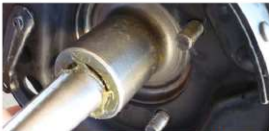
Fig.2 This is how far the bolts protrude through the backing plate and the emergency brake carrier. The grease baffle, which is very thin, has not been installed yet.