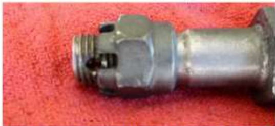
Fig.1 Shows the castle nut run all the way up on one of the mounting bolts. The hole protrudes way past the end of the castle slot in the nut. This is often how the relationship of the bolt and nut ends up after the backing plate, emergency brake carrier, and grease baffle are installed.

This phenomenon occurs even with original bolts and all the other hardware being original. In a number of cases I found the four mounting holes in the backing plates wallowed out in the shape of a football caused by the backing plate rocking back and forth during braking and acceleration.