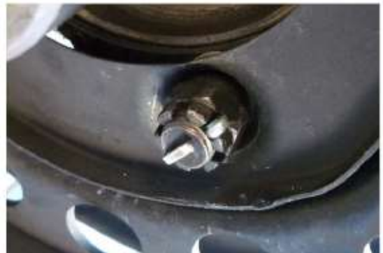
Fig.5 The final photo shows the backing plate installed using a nominal .020 of shims on each bolt between the emergency carrier and the grease baffle. The castle nut is properly aligned at the end of the mounting bolt and the cotter pin installs neatly.